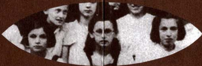
Through The Eyes of a Friend

Theatreworks/USA, a non-profit organization originating in 1961, is America's largest theatre for young and family audiences. Theatreworks' goal is to create original plays and musicals of imagination and sophistication, which educate, entertain, and convey ethical and thought-provoking messages to young people. We annually tour coast to coast performing to an audience exceeding three million.